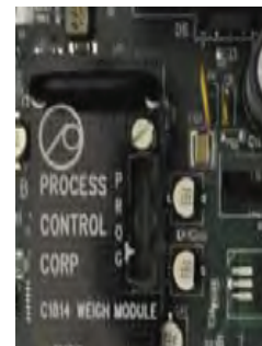
New Single Weigh Module Chip

weigh modules are considered obsolete so upgrading to our latest DSP weigh modules. They incorporate an improved, multilayer, low pass filter for noise and vibration each channel. With improved usable resolution and temperature drift, metering rates accurately, down to 0.25 PPH. The new module is also easier to configure, with im-